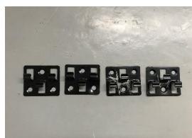
Clip (after test)