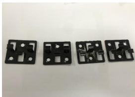
Clip (before test)