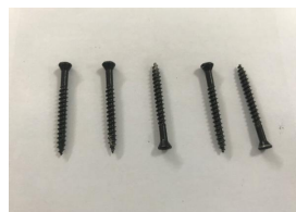
Screw (before test)