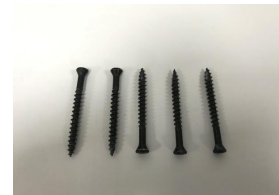
Screw (after test)