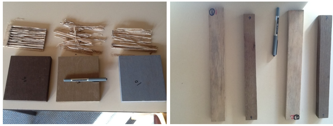
Figure 5: Wood plastic and radiata pine samples after eight weeks exposure to termites (left) and twelve weeks exposure to decay fungi (right).

Termite and decay fungi were unable to attack and damage the P. radiata wood blocks control as shown in Figure 5 and as described in the graphs below (fig 6 & 7):