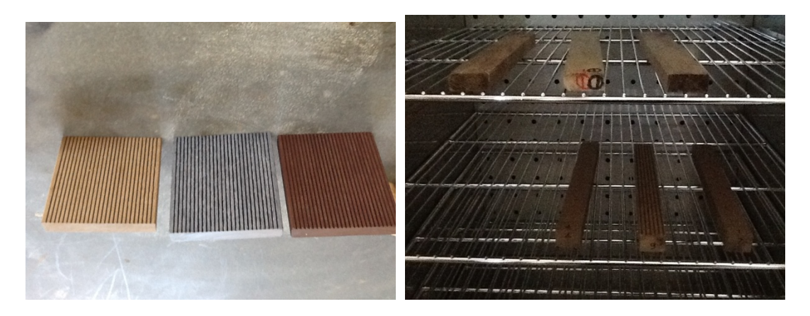
Figure 3: Wood plastic termite test specimens (left) and oven drying of test specimens of both plastic wood and P. radiata for decay test (right).

(ii) Randomisation: Both timber specimens were pooled and randomly allocated into groups. Prior to installing the timber specimens to test, they were oven dried for initial mass loss and were set to mean moisture content (m.c.) of about 11 %. Mean density of the specimens at 11 % m.c. was calculated to be 470 kg/m<sup>3</sup> ( P. radiata ) (Fig. 3).