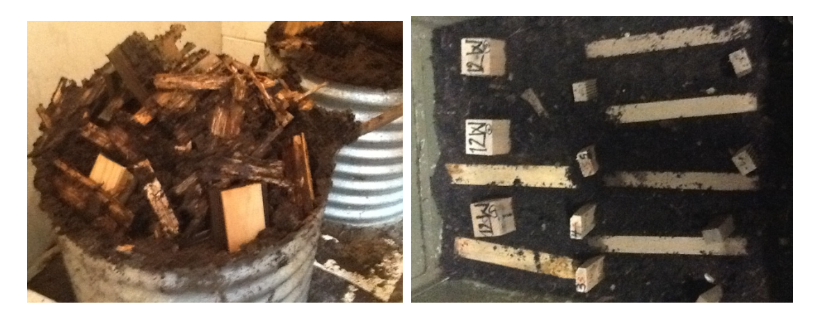
Figure 4: Wood plastic and P. radiata test blocks exposed to termite colony (left) and decay fungi (right).

Five replicates of the four different colour of Wood plastic were prepared for the termite test (250 mm x 250 mm x 25 mm) and decay test specimens were 300 x 40 x 25 mm and relatively similar size of P. radiata wood were prepared. Each test unit consisted of wood plastic specimens and P. radiata wood samples in active colony of termite and decay test tank in a standard condition of 27°C and 75% Relative Humidity (R.H.) (Fig 4).