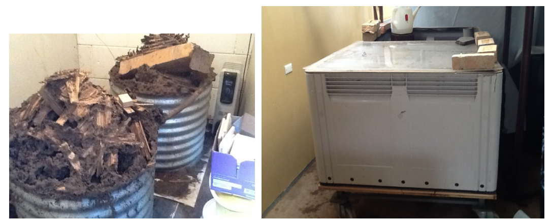
Figure 1: Two termite nests in conditioned rooms with actively foraging and feeding workers/soldiers of the subterranean termite Coptotermes acinaciformis . The left tanks are two half of 44lt gallon drums and the right tank is 1162 X 1162 X 780 ml.

Two active termite colonies of C. acinaciformis were used in this test and the test specimens were directly placed in the termite tank against foraging termites from the termite colonies. All termites used in the AFS test were from two discrete above-ground colonies of C. acinaciformis in Victoria (Fig. 1).