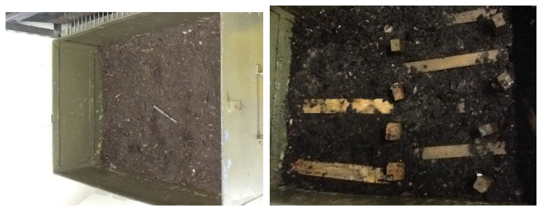
Figure 2: Decay test tank (1200 L X 750 W X 750 D mm) with freshly collected soil and test stakes installed in-ground and above ground on the soil surface exposure.

Fresh field soil collected from East Gippsland forest for the decay test and placed in a tank in the AFS condition room ( 27^{\circ}C \& 80\% RH) for the decay test as shown in the photo below (see Fig. 2).